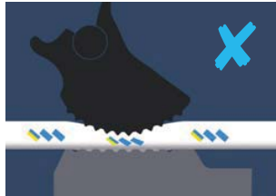
Instead of just jamming the rope...